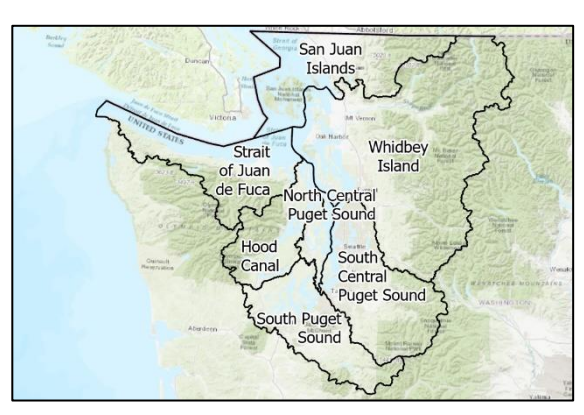
Map 1. Puget Sound Action Areas.